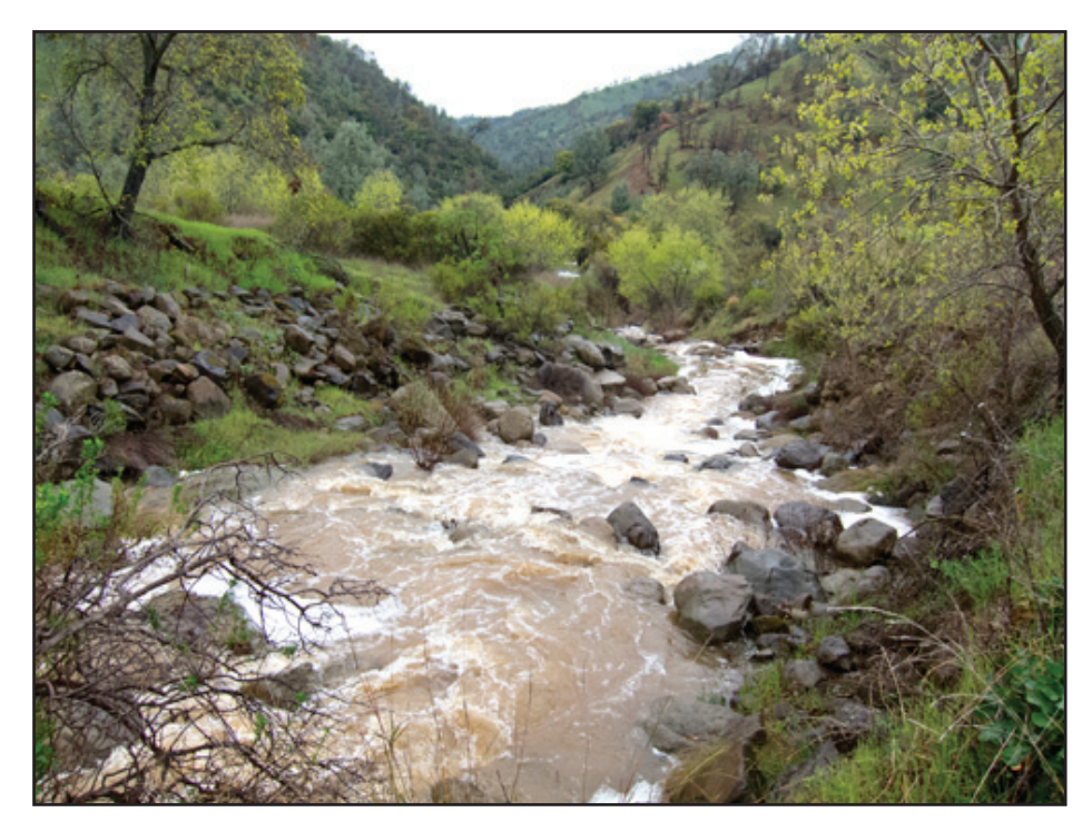
Cold Creek looking downstream toward Putah Creek on 3/14/2012

Per our recent discussion, the storms during the week of March 12th, 2012, created a situation where I thought Thompson Creek would be ripping. WRONG. Thompson creek was dry, the images below show the significant flow coming from Cold Creek Canyon on March 14, 2014.